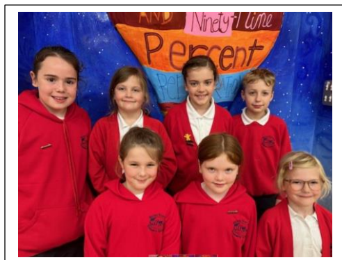
Our House Captains...