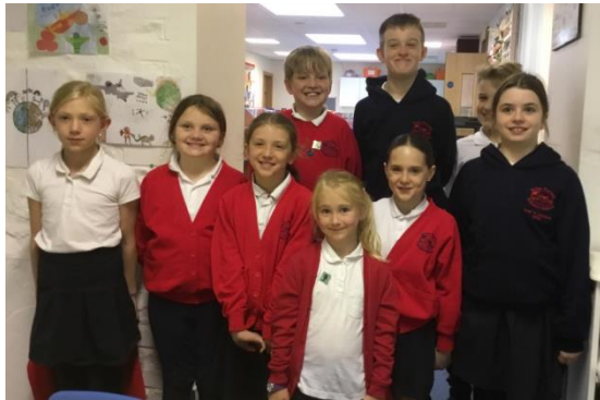
Our School Council...