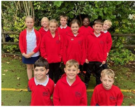
Our Year 5 Playleaders