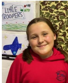
Our Sports and Play Council