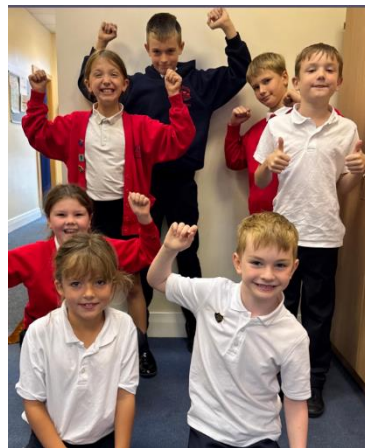
Our Head Boy and HT PA