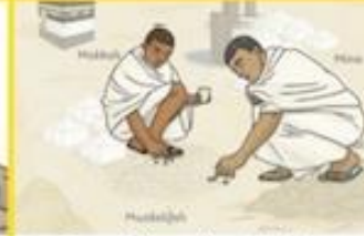
6. Spending the Night in Muzdalifah