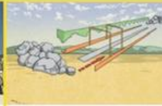
3. Saee: Walking and Running Between Al-Safa and Al-Marwa