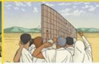
11. Throwing the Pebbles at the Three Pillars