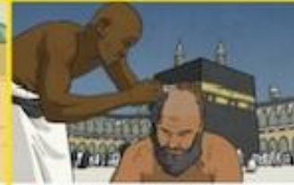
9. Shaving the Head