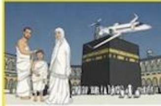
1. Intention and Ihram