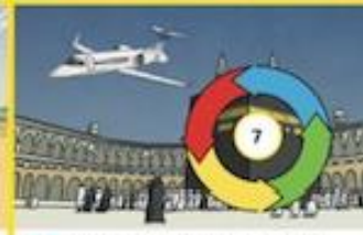
12. The Farewell Tawaf