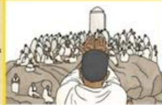
5. Arafah Day