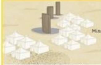
4. Spending the Night in Mina