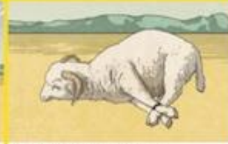
8. The Day of the Sacrifice