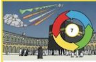
10. Tawaf and Saee Once More: Tawaf Al-Ifadah