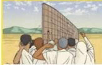
7. Throwing the Pebbles